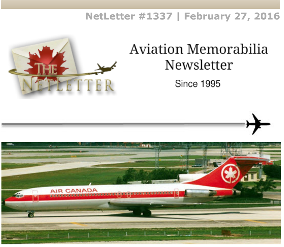
Air Canada B727-200

Welcome to the NetLetter, an Aviation based newsletter for Air Canada, TCA, CPAir, Canadian Airlines and all other Canadian based airlines that once graced the Canadian skies.