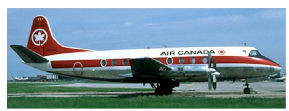
Vickers Viscount CF-THS