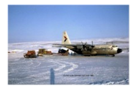
Loading in the high Arctic.

Pacific Western Hercules flew the rigs, fuel and their equipment, while L188 Electras, 737C and 727C combis flew the crew changes to/from Alberta. I have attached a few snaps from that era to show the size of some of the loads.