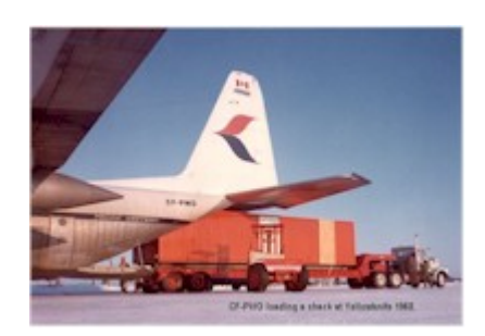
Loading a workers shack at Yellowknife.