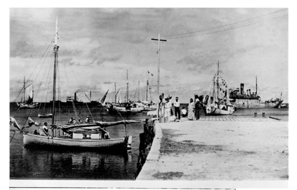
"L-MARSHALL ISLANDS, JALUIT ATOLL, JALUIT ISLAND. ONI #14381 JALUIT HARBOR.