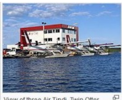
View of three Air Tindi, Twin Otter airplanes, Yellowknife