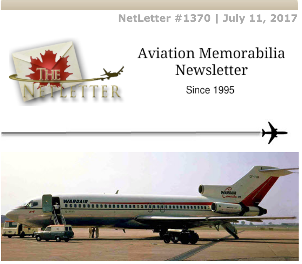
Wardair CF-FUN B-727-11 (June 1970)