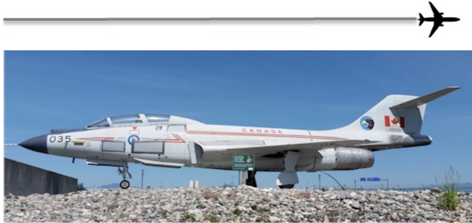
RCAF CF-101 Voodoo # 035 at YXX