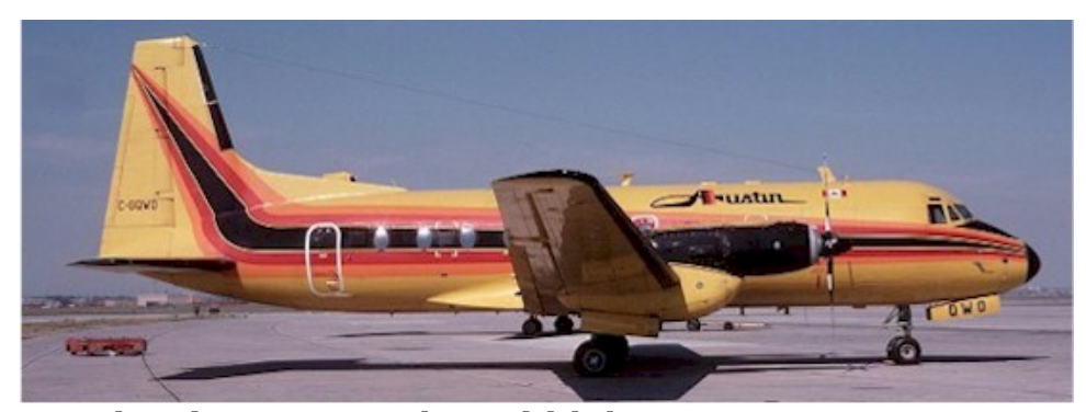
Austin Airways Hawker Siddeley HS 748 at YYZ 1985