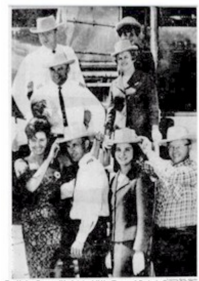
Buffalo Days flight to YUL Expo 67 July7th1967. Regina.

On July 7th, 1967, six crew members of Pacific Western Airlines, who were operating over 40 flights from Western Canada to Expo 67 that summer, were presented with Buffalo Days hats before taking 94 passengers, mostly Saskatchewan Government Telephones employees, from Regina to Montreal.