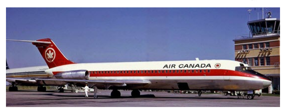
CF-TLV Air Canada DC-9-32 YXE (May 1969)