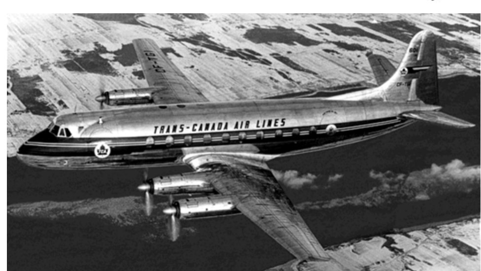
TCA Vickers Viscount - CF-TGI