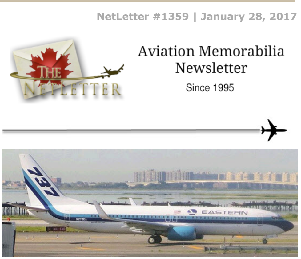
Eastern Air Lines Boeing 737-800 at JFK