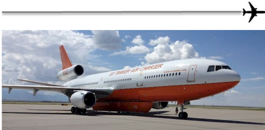
DC-10 Air Tanker - N522AX

Welcome to the NetLetter, an Aviation based newsletter for Air Canada, TCA, CP Air, Canadian Airlines and all other Canadian based airlines that once graced the Canadian skies.