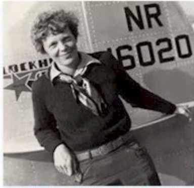
The Ninety-Nines First President Amelia Earhart