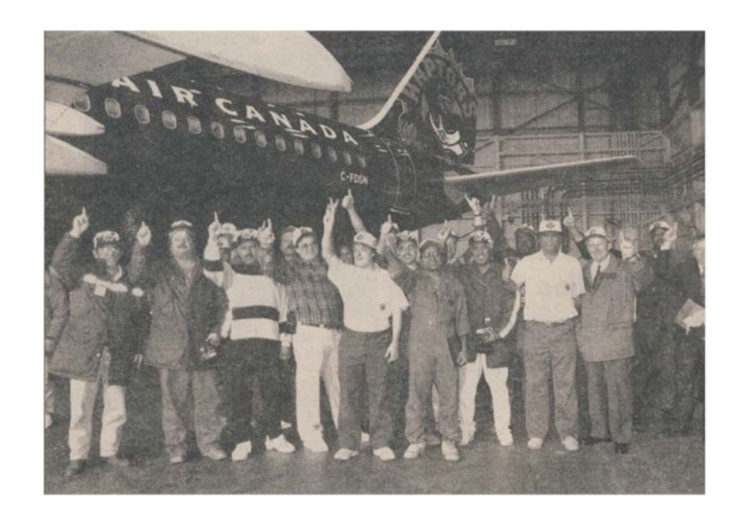
Issue dated March 1996.