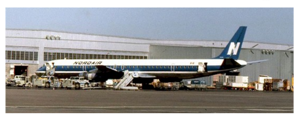
Nordair DC-8-61CF - Registration C-GNDA