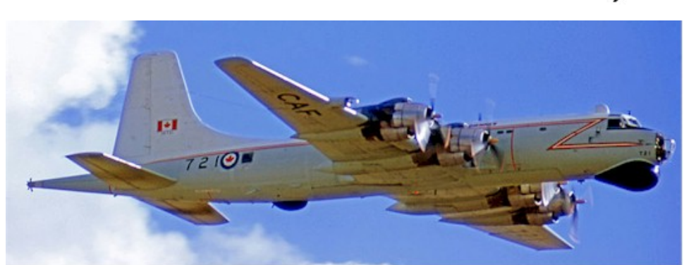
Canadair CP-107 Argus (CL-28)