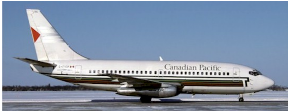
Canadian Pacific C-FICP Story in CP Air, Canadian People Gallery