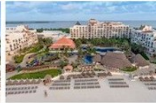
Fiesta Americana Condesa Cancun