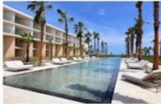
Grand Palladium Costa Mujeres Resort & Spa