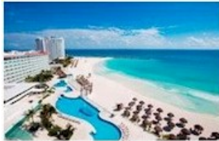
Krystal Cancun Cancun