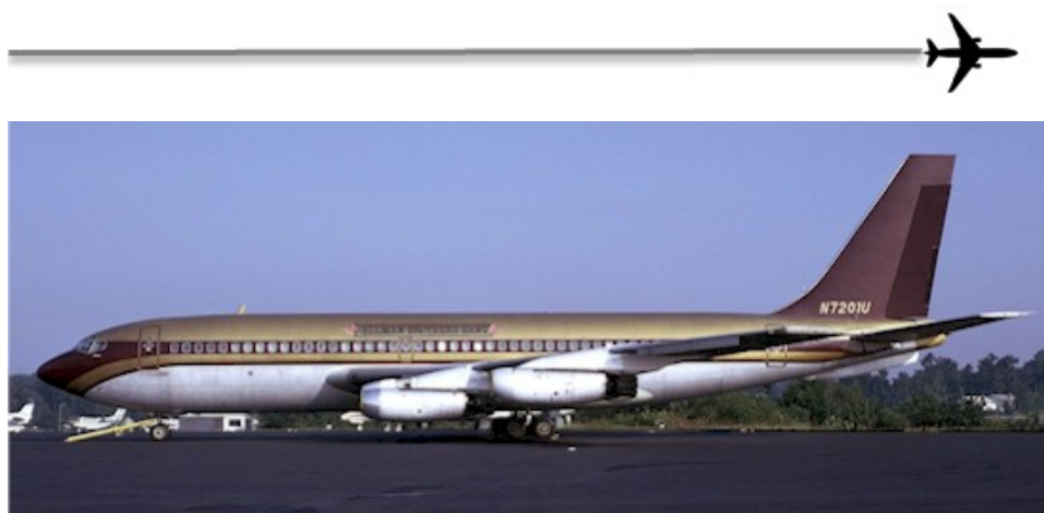
Former United Airlines Boeing 720 - N7201U 'The Starship' in Allman Brothers livery