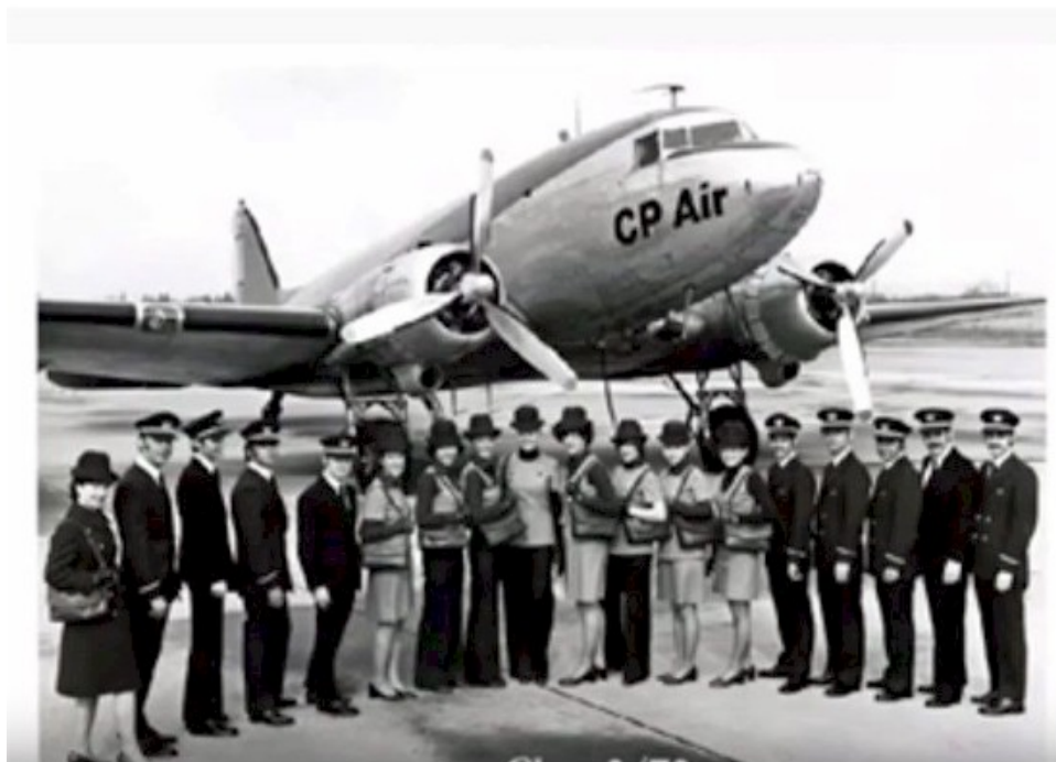
Class of '73