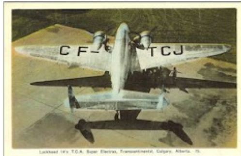
Lockheed L-14-08 Super Electra CF-TJC.