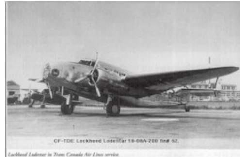
Lockheed L-18-08A Lodestar CF-TDE - Fin # 52