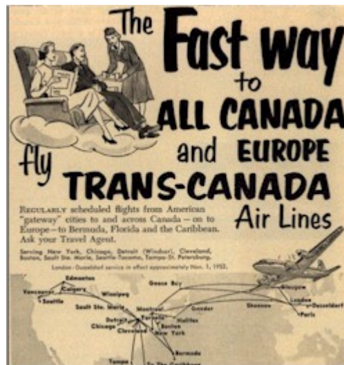
The Fast way to All Canada and Europe