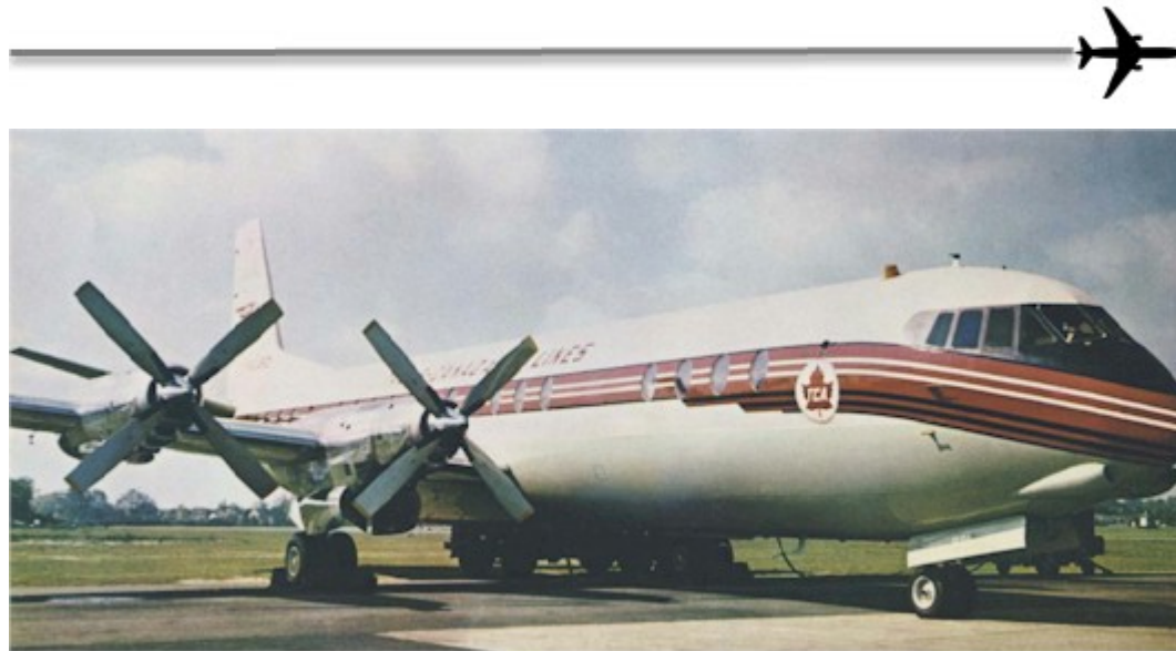
Vickers Vanguard TCA / AC - 1961 - 1972