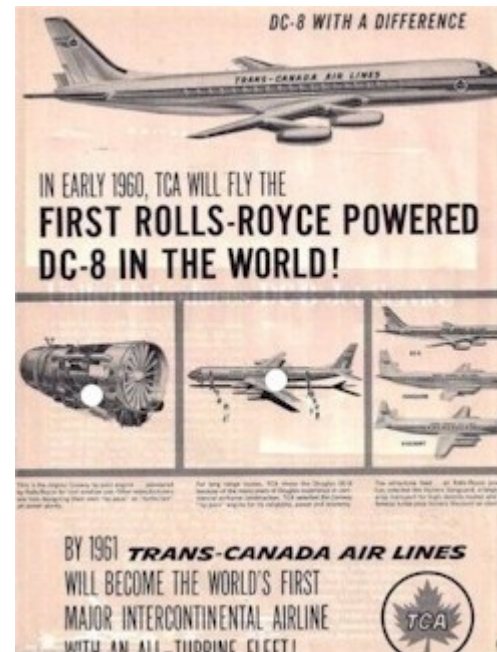
DC-8 first Rolls-Royce powered in the world.