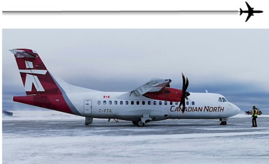
Canadian North ATR 42-500